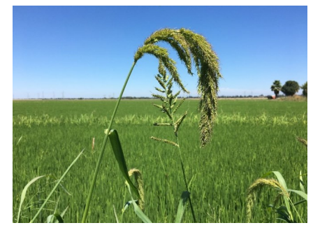
Figure 1. Early watergrass (top panicle) and barnyardgrass (center panicle) are two typical weeds in the Delta system.

Weeds are the most problematic pests in Delta rice fields. Grasses - like barnyardgrass and watergrasses (Echinochloa spp.) and sprangletop (Leptochloa fascicularis) – are the most challenging weeds (Fig. 1), but broadleaf weeds and sedges must also be managed. The Delta system also has weeds that are not found in other regions, like nutsedges (Cyperus spp.). In the drill-seeded system, growers manage weeds with pre-plant cultivation and ground application of herbicides before the permanent flood is established. Herbicides are applied when the rice has about three to four leaves. The flood should be applied within a few days after herbicide application to avoid impacts to the rice. Later in the season, an aerial herbicide application may be applied to manage weeds that escape the ground application, but often