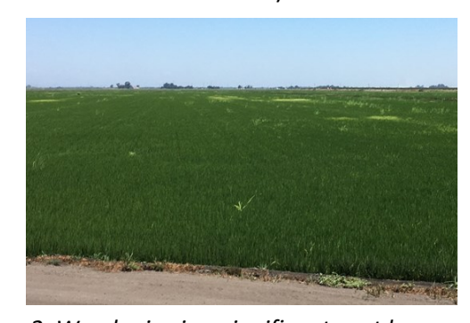
Figure 2. Weedy rice is a significant pest because it reduces crop yield and quality. Weedy rice may be observed as light-green patches of plants that stand taller than the cultivated variety.

Wetland plants like cattails (e.g. Typha L.) can become weedy in the Delta system, particularly if they emerge ahead of the rice crop and outcompete the rice. Cattails are difficult to control because they propagate by seed and underground rhizomes that become new plants if divided, as from tillage. Herbicide application can help to manage cattail pressure, but application timing is critical. Research has shown that control can be achieved if cattails are small (i.e. less than three feet tall).